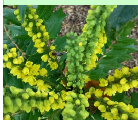
Mahonia, in flower now and source of forage.

Church of the Good Shepherd 7th-9th April 2017 BBKA Spring Convention Harper Adams University