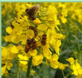
Honeybees on Oil Seed Rape. The Rape is already in flower across the county!